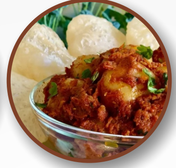
Luchi Aloo Dum