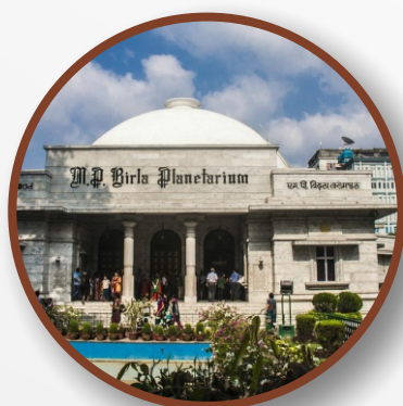
M.P. Birla Planetarium