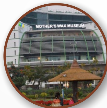
Mother's Wax Museum