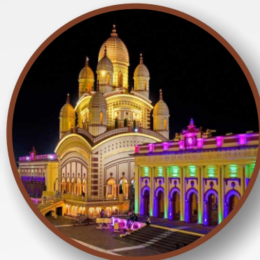
Dakshineswar Kali Temple