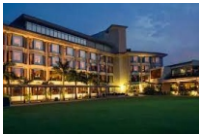
Hotel Mountview 1.4 km