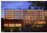
Hyatt Centric 2.6 km