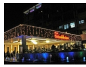
Hotel Shivalikview 3.0 km