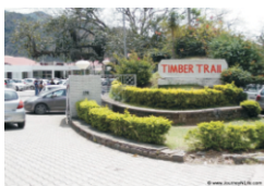
Timber Trail, Parwanoo