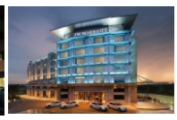
Hotel JW Marriott 6.0 km