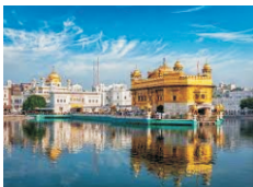
Golden Temple, Amritsar