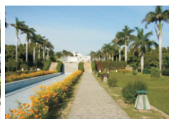
Yadavindra Garden, Pinjore