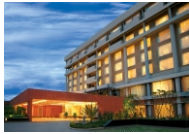
Hotel Taj 2.5 km