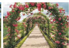
Rose Garden, Chandigarh